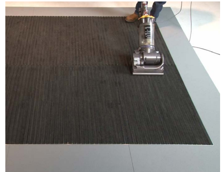
15 Clean the unit with a vacuum.