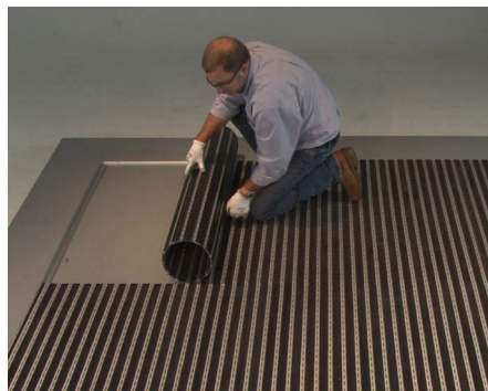
17 Care & Maintenance: to properly clean underneath the mat and avoid rail damage, roll back the mat edge to the 12th rail. Continue to roll back the mat holding that diameter.