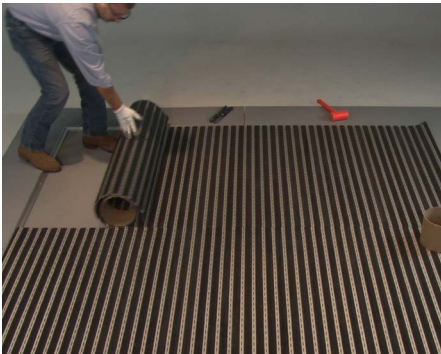
13 Repeat steps 8 -12 for adjacent sections.