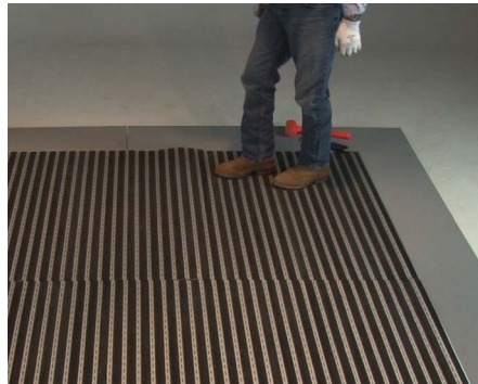
14 Scuff or drag your heel to align the mat. It may be necessary to lift and flap/shake the mat for final alignment.