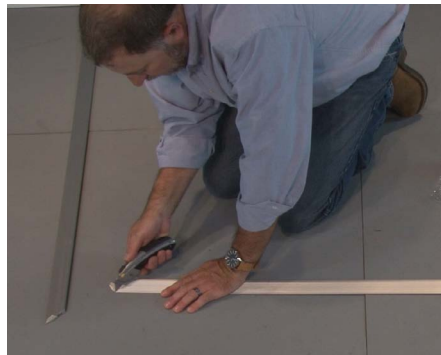
2 Prepare the flooring surface to allow the tape to properly bond to the floor.