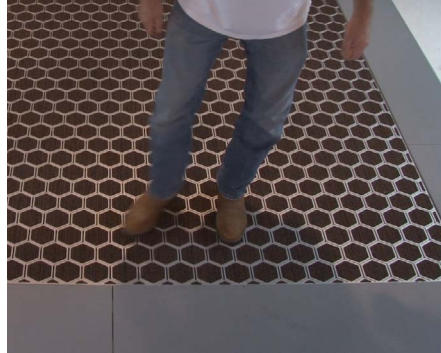
17 Apply uniform pressure to engage the dual lock.