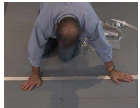
6 Firmly press down on the entire length of the frame to activate the tape.