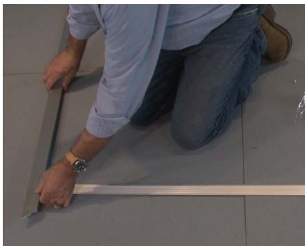
4 Apply the frame to the substrate.