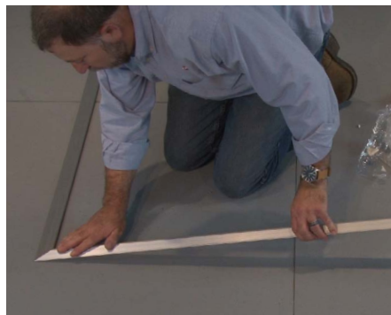
5 Make sure the frame is square and the miters butt properly.