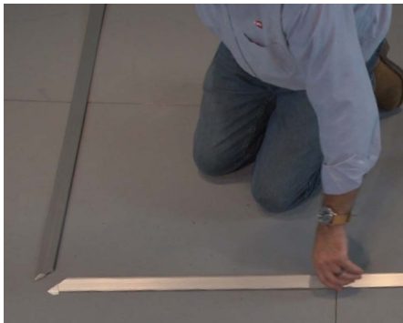
1 Place the pre-mitered tapered aluminum frame at the correct floor location.