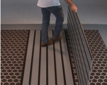
16 Inspect for damage and replace module after cleaning.