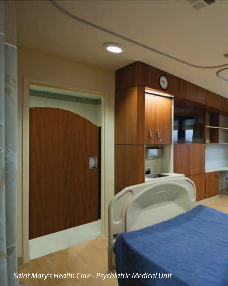
Saint Mary's Health Care - Psychiatric Medical Unit

People may believe that hospitals and behavioral health facilities can be built with the same products, but C/S knows this isn't true. Detachable material and potential ligature points, often overlooked in the general hospital environment, could be used by psychiatric patients to harm themselves or others.