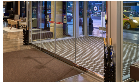
Entrance Mats + Grids including Peditred, Pedigrid (etc)

Does your space call for curtains? Keeping curtains clean is easier than ever with our extensive line of curtain and track systems. These include On the Right Track®, Snap Lock and Qwik Switch™ which all allow for quick, easy, and safe removal of curtains for laundering. Another alternative is Disposable Curtains which make it easier to keep privacy curtains clear of dangerous pathogens and protect the physical health of the building's users. The disposable curtain material is treated with antimicrobial agents to protect against bacteria. Our HUSH Clean-in-Place™ curtain option doesn't need laundering, making it ideal for areas that require frequent cleanings. These privacy curtains are made with a vinyl-coated laminate, wipeable linen, and antimicrobial fabric protections that lasts the lifetime of the curtain.