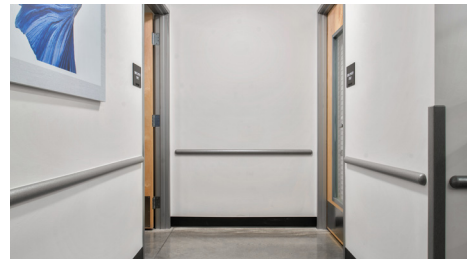
Acrovyn® Wall Protection including Corner Guards, Crash Rails, Handrails, Door & Frame Protection

*In an independent test laboratory, Acrovyn was evaluated for resistance to bacteria in accordance with ASTM G 22-76(1996), Standard Practice of Determining Resistance of Plastics to Bacteria, Acrovyn resisted the growth of the Pseudomonas Aeruginosa bacterium culture. Click for the pdf.