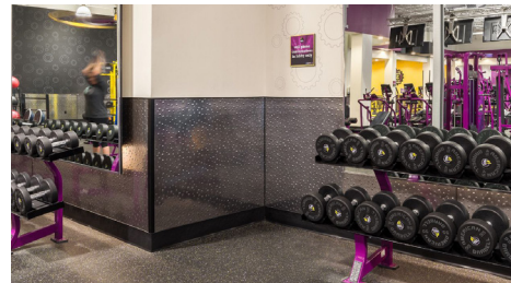
Acrovyn® Wall Covering + Panels