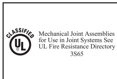
UL Label †