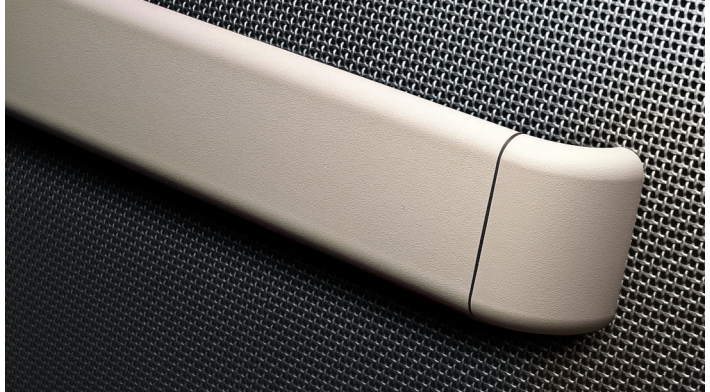
HRB-4CHLN / HRB-4CCMHLN

In addition to designated bariatric wings, there are other key areas like emergency rooms and outpatient service areas that need to be considered when planning for a handrail installation. Visit www.acrovyn.com/handrails for a test summary report or call Construction Specialties at 800.233.8493.