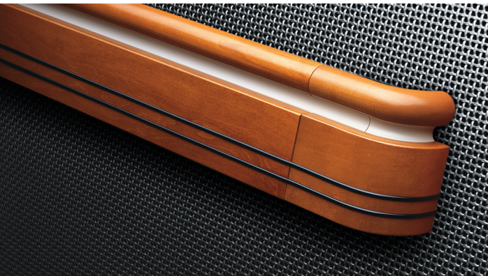
HRW-10CGHL / HRW-10CVHL / HRW-10CHL