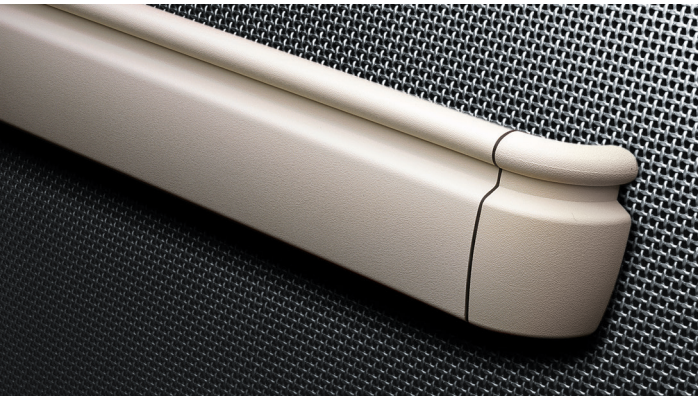
HRB-20HLN / HRB-20CMHLN