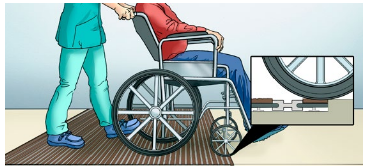
If the entrance flooring is recessed , it should remain flush with the surrounding floor.

Construction Specialties Entrance Flooring Systems have been the gold standard since 1969. As established industry experts, we know the rules and regulations for building safety. Our products are designed to be durable and code compliant while adding to the aesthetic value of a building. Contact us for help with designing your entrance to ensure ADA requirements are met.